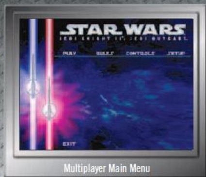
Multiplayer Main Menu

NOTE: View the Readme on the game CD for last-minute manual updates and additional game information.