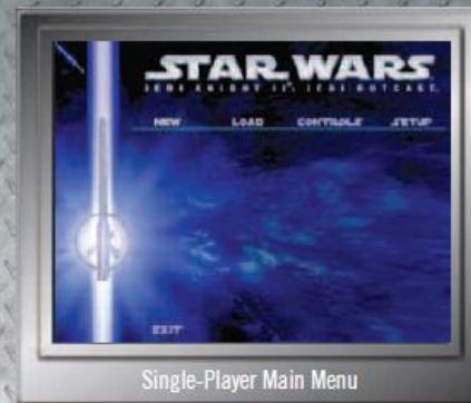
Single-Player Main Menu