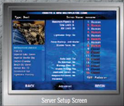
Server Setup Screen

If you'd like to start your own server, click the Create Server icon. From here, you'll be brought into a Setup screen where you can customize the game you're about to run. You can set the game type, maximum number of players, map, password, time limit, AI Bots, and more. In the Server Setup menu, you can open slots for Bots and set their overall difficulty level before starting the game. Just like having a lot of human